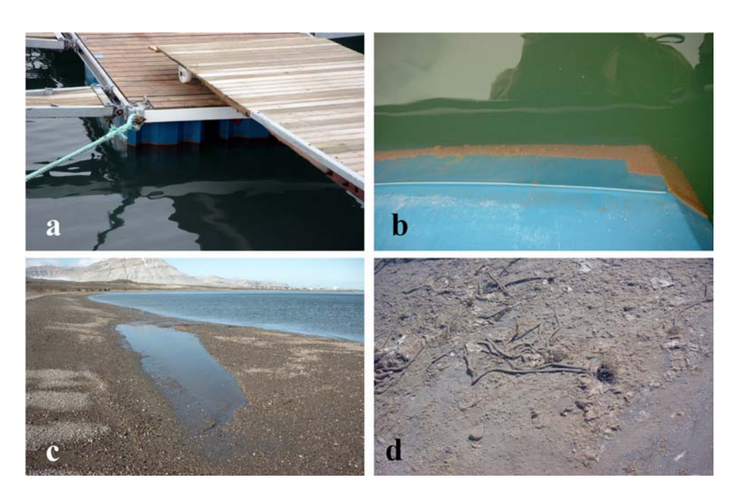
Fig. 1. Sampling sites in this study. (a) A floating pier around the Korean Arctic Research Station Dasan located at Ny-Alesund, Svalbard, Norway, (b) biofilms formed on the floating pier, (c) a tide pool near the seashore, and (d) dead brown algae in the tide pool.

the laboratory of the Korea Polar Research Institute (KOPRI) under freezing conditions in a Biocooler (Biosmith, USA). The samples were diluted 50 to 1000-fold in sterilized seawater and spread on Zobell agar plates fortified with 1% skim milk (skim milk 10 g, peptone 5 g, yeast extract 1 g, FePO<sub>4</sub> 0.01 g, agar 15 g, sterilized water 250 m l , aged sea water 750 m l , pH 7.0). Following a seven-day incubation period at 10°C, colonies forming clear zones were selected as protease-producing bacteria.